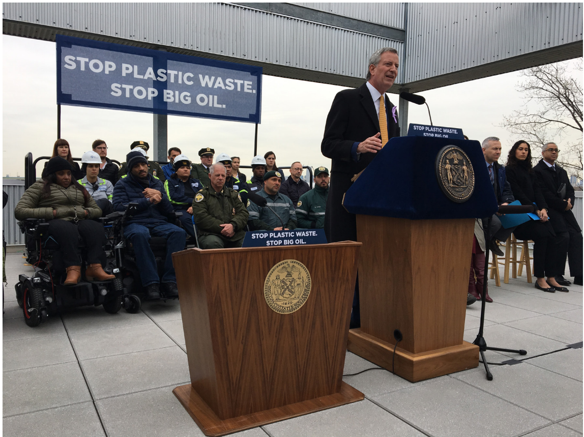
Mayor de Blasio announcing the reduction of City spending on single use plastic foodware

Unlike many other cities in the country, NYC reviewed policies around plastic straws with individuals with disabilities. Thus, rather than a ban on the single use plastic straw, the Mayor issued an Executive Order reducing the purchase of single use foodware items including straws and requiring each agency maintain a supply of single-use plastic straws and other foodware for individuals who request such items. Many individuals with disabilities need plastic foodware as current alternatives are not sufficient to accommodate their needs.