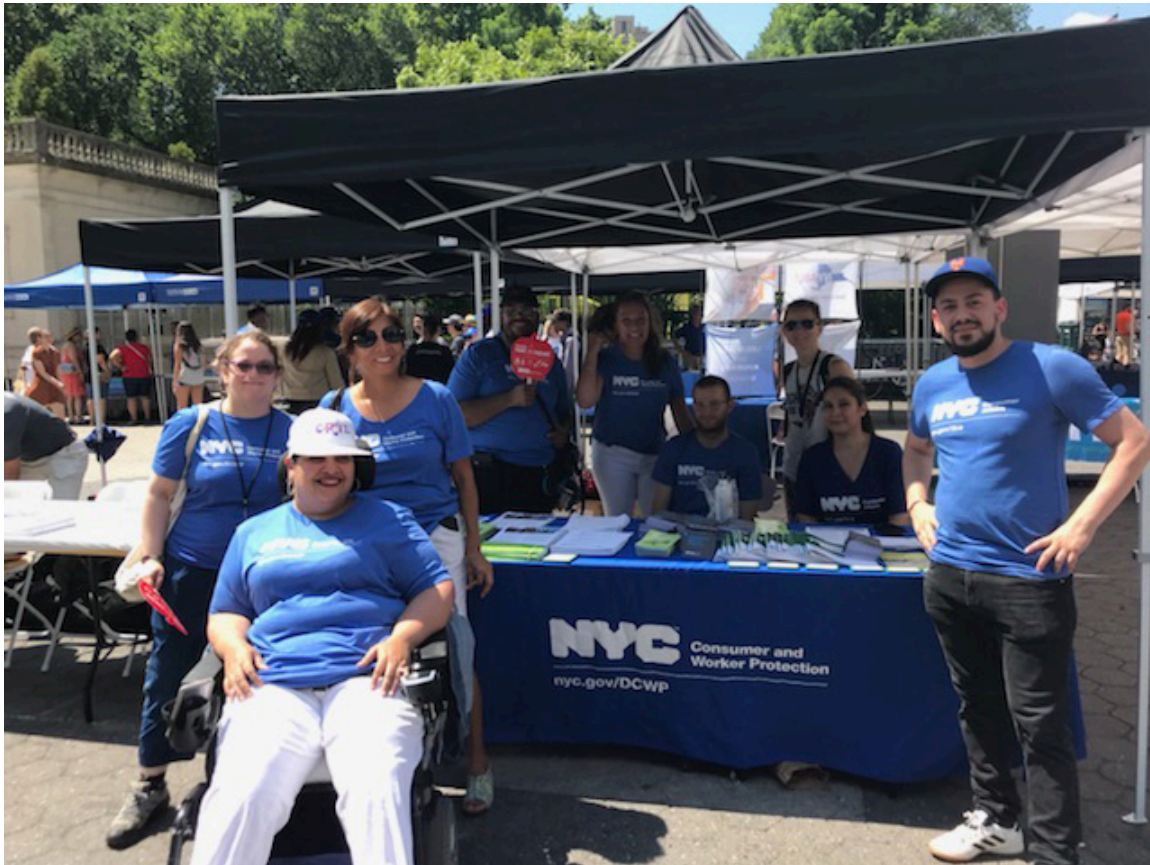
NYC Department of Consumer and Worker Protection sharing information at the NYC Disability Pride Parade

Empowerment ED offers monthly free webinars for service providers: caseworkers, Vocational Rehabilitation counselors, Workforce One staff, college career offices, offices for students with disabilities, and municipal staff. Topics include overview of SSI and SSDI, NY ABLE Act accounts, building and improving ones credit score, tracking expenses, preparing for tax time, and financial stability.