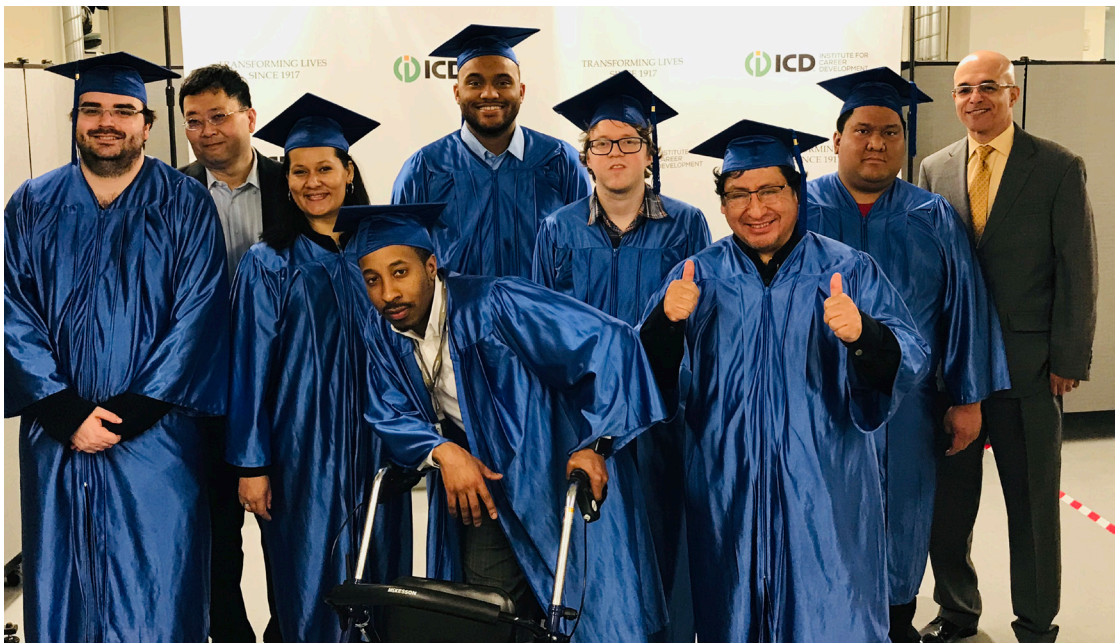
The first Ability Academy graduating class

The inaugural cohort opened with 16 students diverse in backgrounds, education, skills and disability. Classes have three certification options: CCENT; CCNA Security; CCNA Routing & Switching.