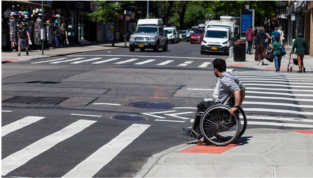
Pedestrian Ramps with red Detectable Warning Surfaces.

All new and upgraded pedestrian ramps include a red (or white in special districts) detectable warning surface to help guide individuals who are blind or have low vision.