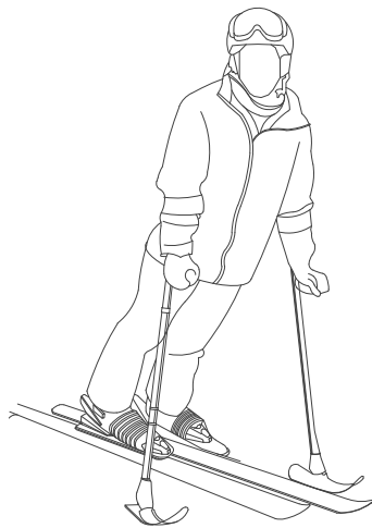
Fig. 1112.12.3.2 Four Track Ski

MOPD completed the Inclusive Design Guidelines: Sports and Recreation, New York City, a resource book that features adaptive sports including wheelchair basketball, beep ball, sitting volleyball, goal ball and sled hockey. The book follows a template for each sport that includes equipment descriptions and illustrations as well as venue/field descriptions and illustrations.