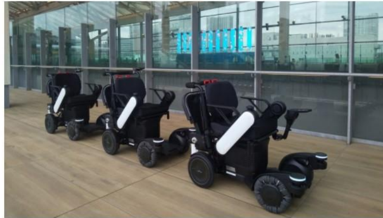
Panasonic Begins Trial of Mobility Service Using Autonomous Tracking Robots at Takanawa Gateway Station