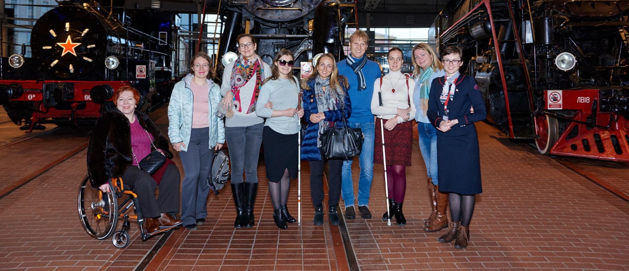
Our Inclusive Team