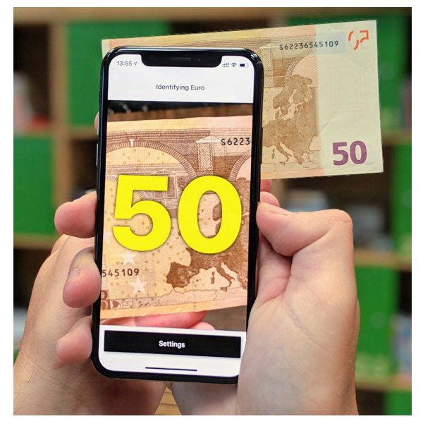
The Cash Reader from the Czech company Hayaku recognizes bank notes from more than 100 countries, using Al.

New technologies, such as Artificial Intelligence, can increase accessibility and independence for persons with disabilities. For example, incorporating AI in user interfaces and user interaction will be particularly useful for persons with sensory and cognitive disabilities.