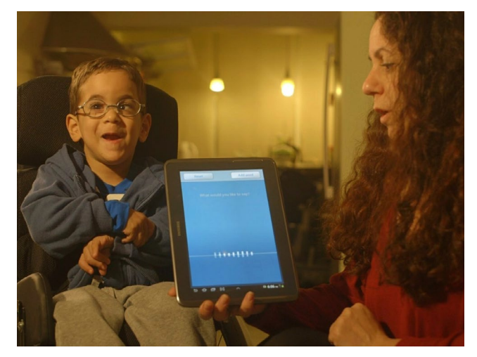
Voiceitt working for this little one.