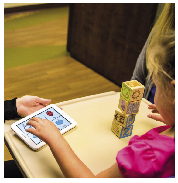
Al of LIVOX uses large symbols to communicate.

Imagine a tool that reads complex texts and creates accurate and comprehensible summaries, or a context-aware communication tool.